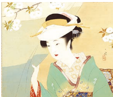
Shōha Itō, Beauty Viewing Cherry Blossoms , 1940 Collection of the Furukawa Art Museum

The Furukawa Art Museum presents a journey through the beauty of Japan's four seasons through artworks held in the museum collection. From the joy of spring, as life, released from the cold of winter, resumes; summer, with green returning to the mountainsides, and the rains heralding the heat; the falling leaves of autumn, reminding one of the circular nature of life, and appealing to Japanese sensibilities; to the darkening days of winter, the first snows reinvigorating the mountains and transforming all to pure white.