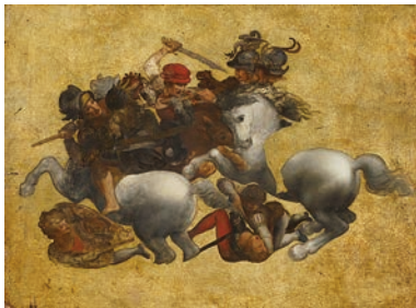
Anonymous artist, after Leonardo da Vinci Tavola Doria (scene of the 'Fight for the Standard' from The Battle of Anghiari) Galleria degli Uffizi (donated by Tokyo Fuji Art Museum, 2012)

The Battle of Anghiari is an uncompleted mural by Leonardo da Vinci which adorned the Palazzo Vecchio in Florence, Italy. Tavola Doria (The Panel Painting of the Doria Family) is a 16th-century oil painting depicting the central section of the mural. This exhibition examines the mysteries of this lost mural, focusing on the Tavola Doria (presented in Japan for the first time), as well as studies for the mural and derivative works, and looks at the various activities in which da Vinci engaged himself. The rivalry between the two great Renaissance masters is also recreated with studies for Michelangelo's The Battle of Cascina , which occupied part of the same building as Leonardo's lost piece, also being displayed in Japan for the first time. Experience the grand spectacle, etched into art history, of the genius's great mural that had such a profound impact on later generations.