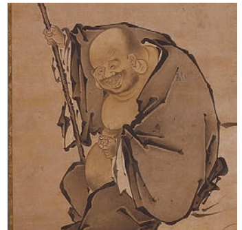
Hotei (detail) Attributed to Kanō Motonobu

An exhibition introducing paintings and decorative art works depicting a variety of stories of intense idiosyncrasy by Chinese figures such as Hotei (Bu Dai / 布袋), Daruma (Bodhidharma / 達磨) and others, as well as Japanese figures such as Ikkyū Sōjun (一休宗純) and Saigyō Hōshi (西行法師).